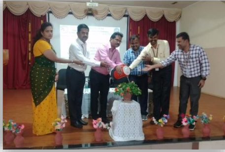
Inauguration by principal and Assitant professors